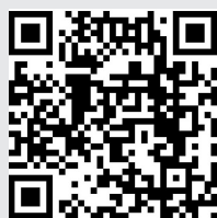
QR code leads to CPN website

Congress Park Neighbors, Inc. P.O. Box 18571 Denver, CO 80218 www.CongressParkNeighbors.org